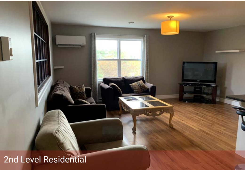
2nd Level Residential