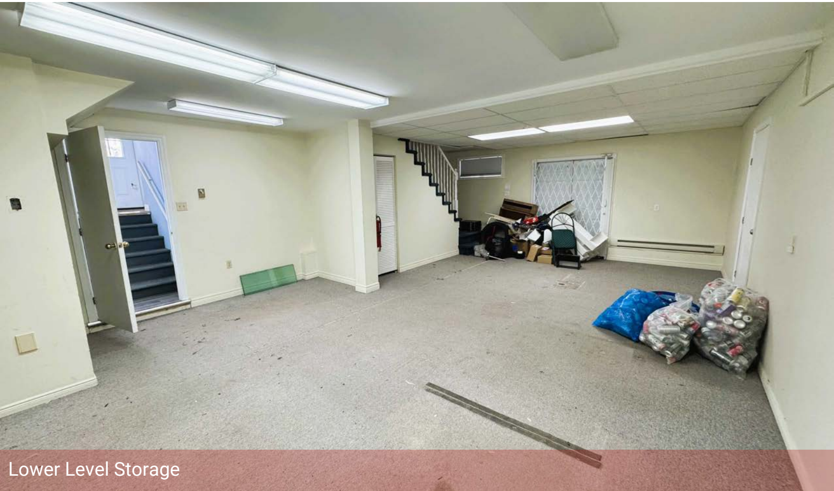
Lower Level Storage