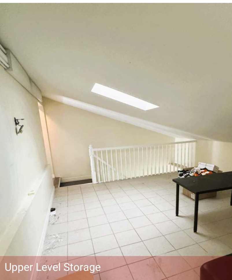
Upper Level Storage