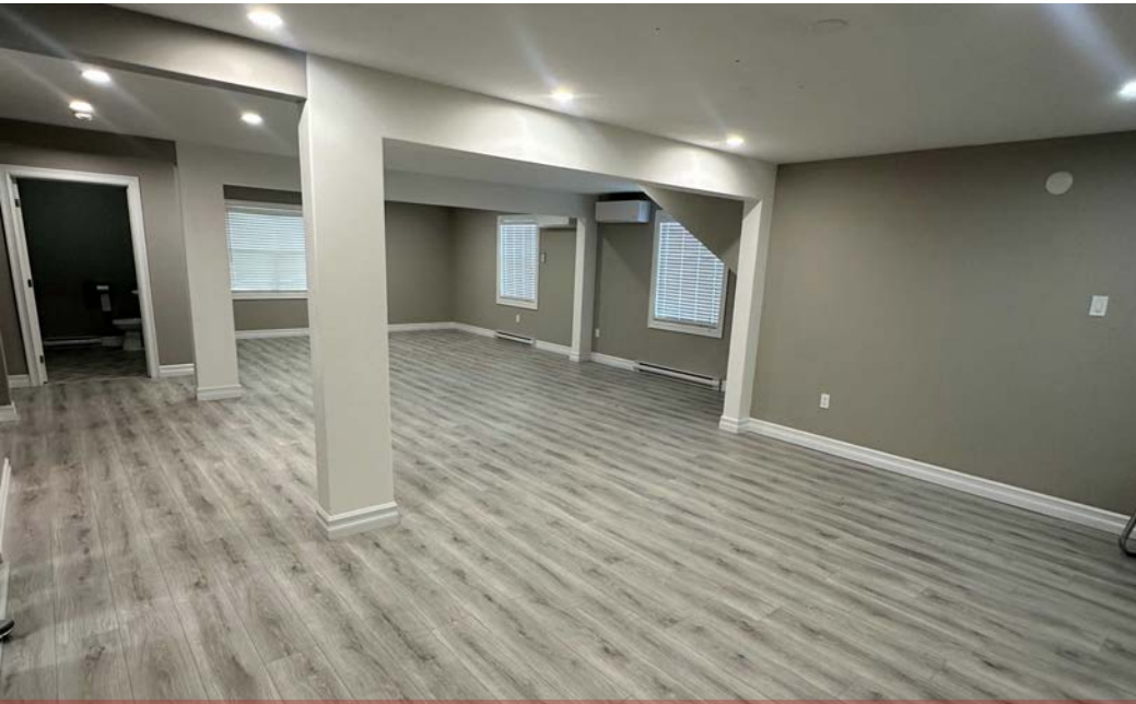
Main Level Office / Retail