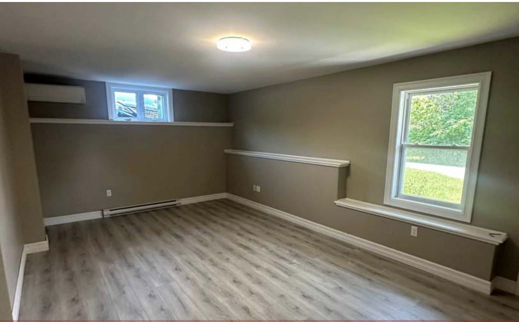
Below Grade Office / Retail