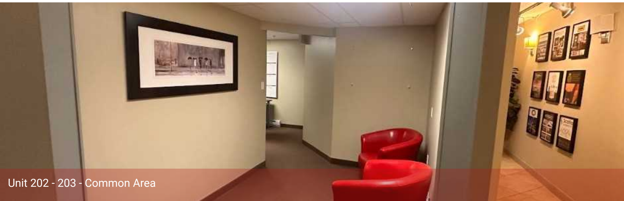
Unit 202 - 203 - Common Area