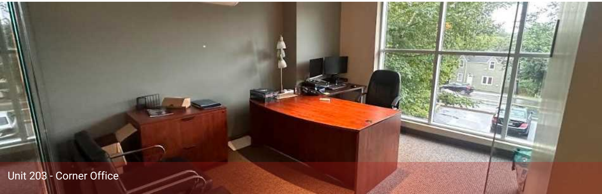
Unit 203 - Corner Office