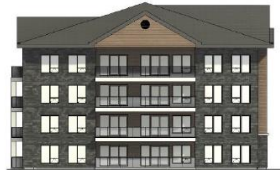
2 West Elevation 1/16" = 1'-0"