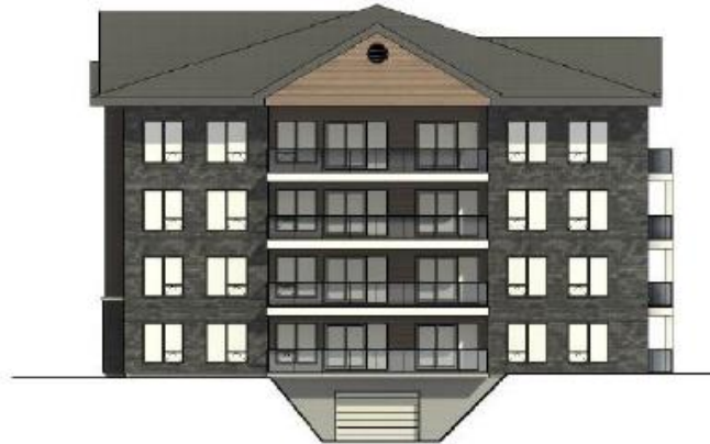
1 East Elevation 1/16" = 1'-0"