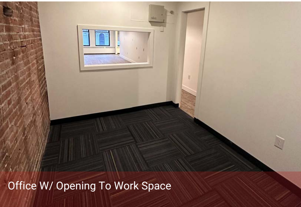
Office W/ Opening To Work Space