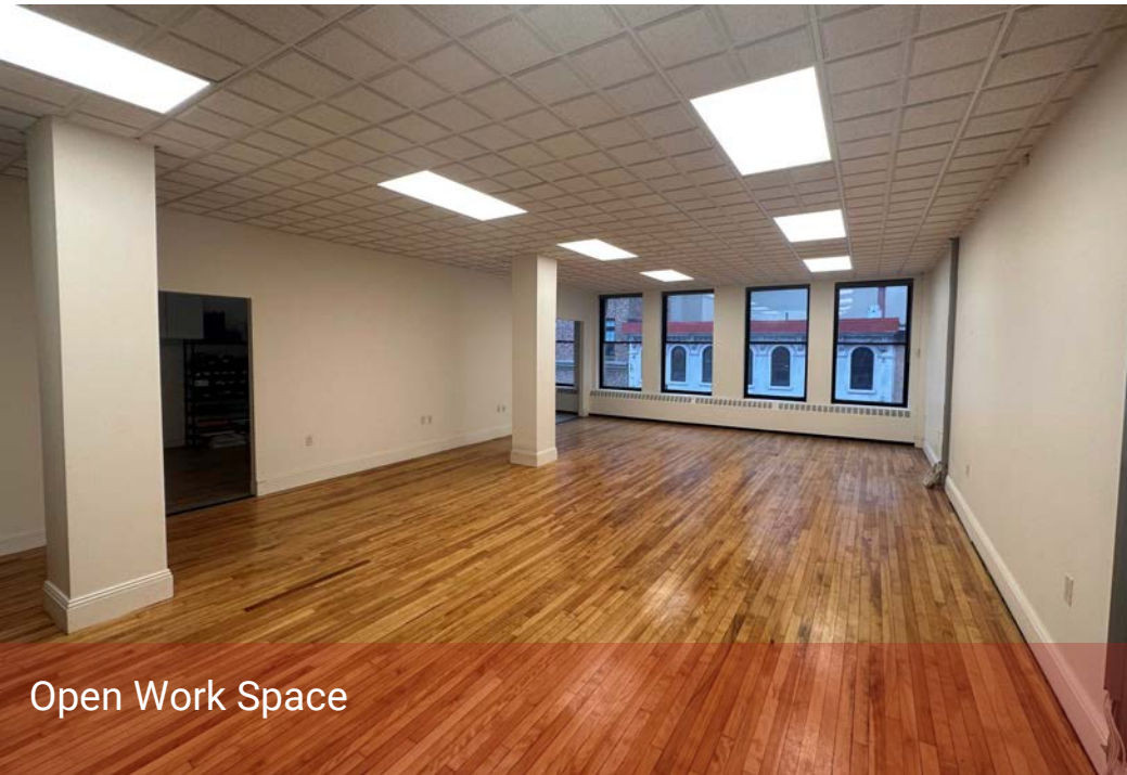
Open Work Space