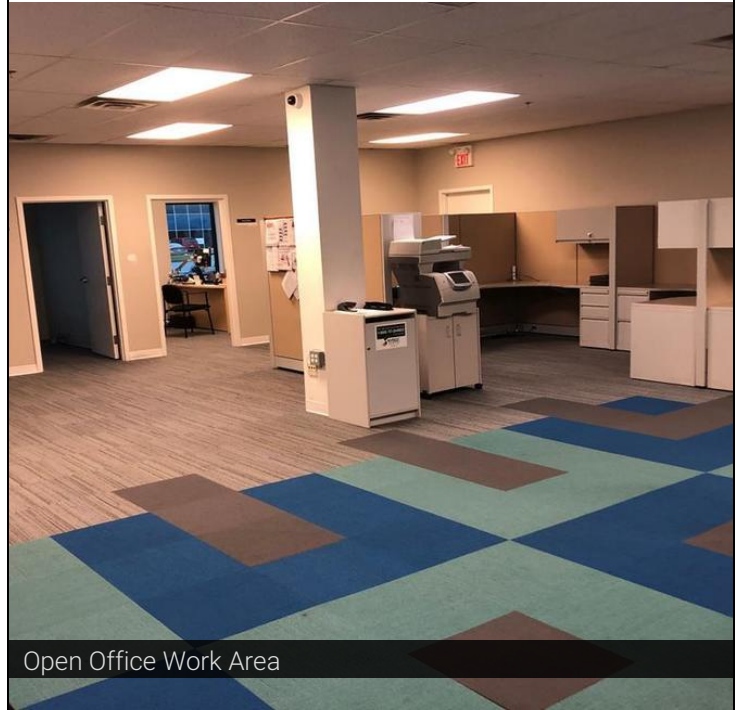
Open Office Work Area